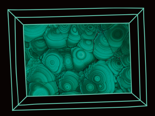
Green Malachite Josephine Oehler (Junior Category)

Explore the Minerals Gallery on Level 3. Have you ever noticed the variety of patterns that occur in geology? Try zooming in on the repeated patterns of the minerals and use the 'crop' function on your device to help with your composition.