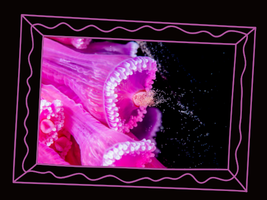
Spawning Jewel Anemones Richard Robinson

The magical world of sea creatures! Nature is full of dazzling colours, especially in coral reef gardens. Head up to the Biodiversity Gallery on Level 2 to visit the sea creatures and coral. Can you take a close-up photograph that showcases the bright colours you see?