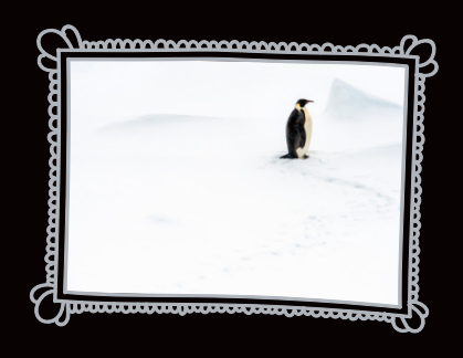
Lone Emperor Justin Gilligan

This emperor penguin is contrasted against an icy white background, which makes it stand out. The same result can also be achieved using colours. Can you photograph a plant, animal or landscape that contrasts like our penguin?