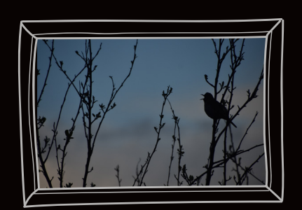
Song Thrush Aidan Cimarosti (Junior Category)

Junior entrant Aidan Cimarosti photographed this song thrush in silhouette nestling into the branches of a tree against a twilight sky. Head outside before breakfast or after dinner and see if you can catch a bird, tree or other natural wonder as a silhouette.