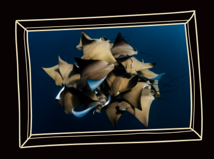
A Fever of Cownose Rays