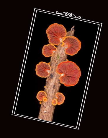
Orange Fan Tess Poyner (Junior Category)

Take a walk, near or far, and capture a botanical wonder. Tip: Do you notice the detail Tess has captured in her photo? Focus on the texture of your plant to give your viewer an idea of its physical form.