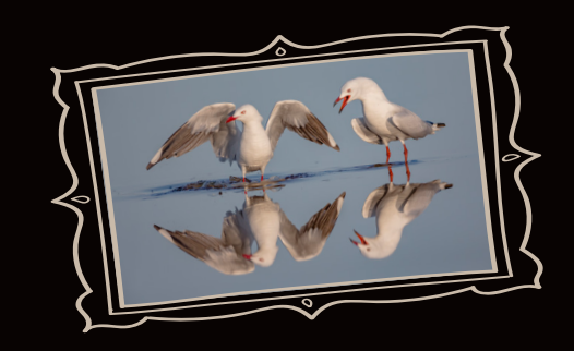
We Are Here! Les Imgrund

Find Les Imgrund's photo of some lively silver gulls reflected in the ocean. Try a clever photo shot in the water , using reflection to create a mirror effect. Head over to the Museum fountains and explore what is reflected in the water through your lens!